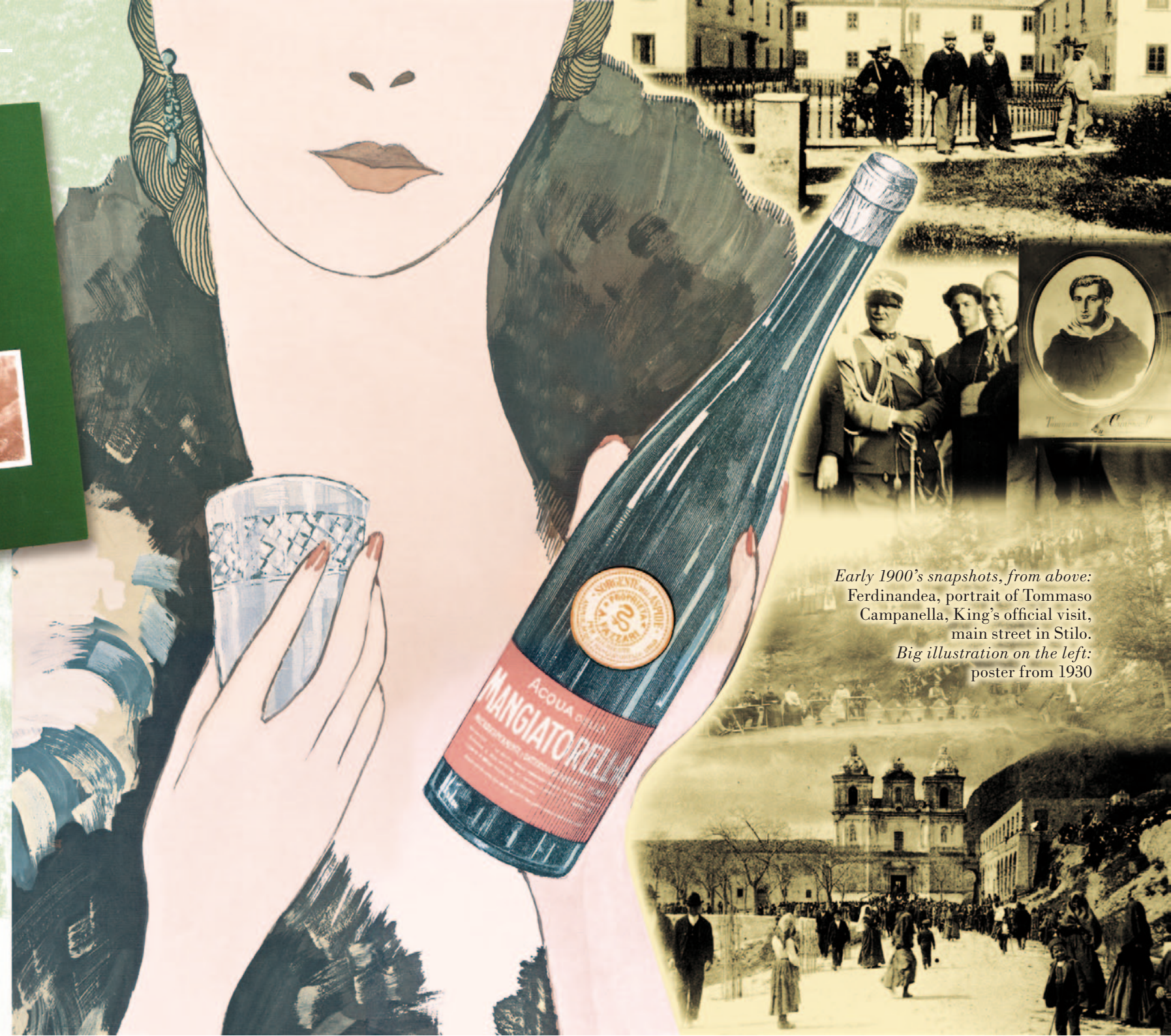
Early 1900's snapshots, from above: Ferdinandea, portrait of Tommaso Campanella, King's official visit, main street in Stilo. Big illustration on the left: poster from 1930